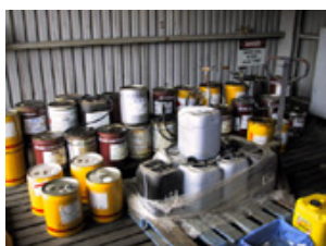
Dangerous Goods Assessments